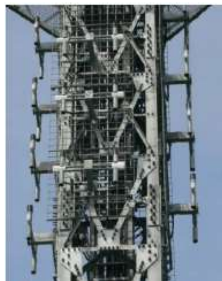
DMB Antenna System in Dae-ryong site