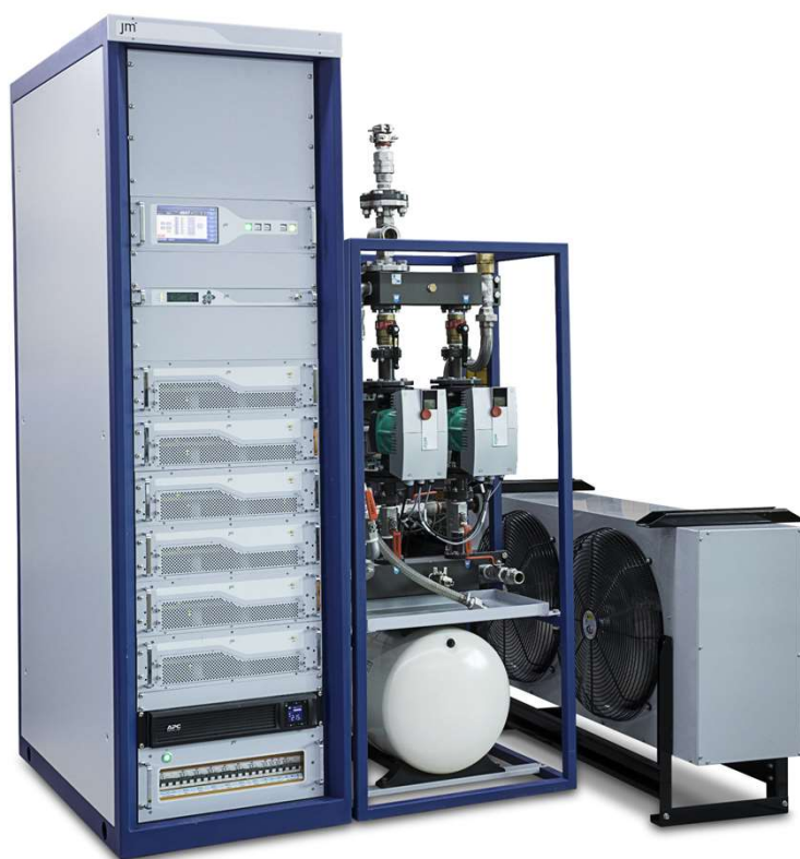
10kW Liquid Cooled DTV Transmitter System