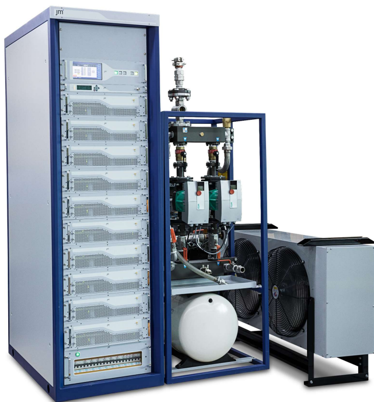
16kW Liquid Cooled DTV Transmitter System